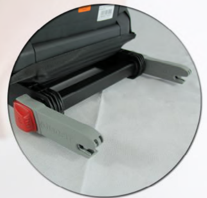
integrated ISOFIX (can be inserted when not in use)