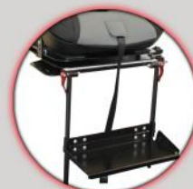
foot rest adjustable in height and angle