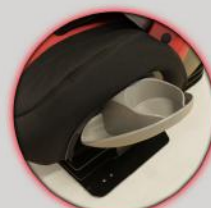
Cupholder to fold-out, on both sides